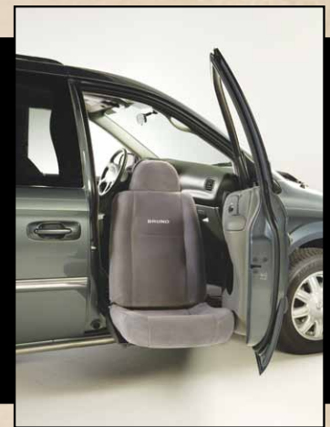
TURNING AUTOMOTIVE SEATING™ (TAS™)

Founded 25 years ago, Bruno Independent Living Aids, Inc., is a world-wide manufacturer of accessibility products designed to enhance the lives of those challenged by limited mobility. In pursuing this goal, Bruno is proud to be the only U.S. manufacturer of indoor/outdoor stairlifts, interior/exterior scooter, powerchair and wheelchair vehicle lifts and Turning Automotive Seating™ (TAS™) products to be ISO 9001 Certified. This is one of the most stringent, widely-recognized quality standards in the world and your assurance that Bruno is committed to providing you with the highest-quality, most reliable products in the industry. Ask your certified Bruno dealer for details on all Bruno independence products.