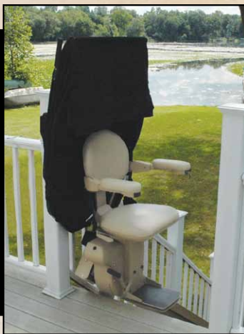
OUTDOOR ELECTRA-RIDE™ ELITE Model SRE-2010E

Home accessibility solutions and automotive products