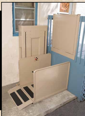
VERTICAL PLATFORM LIFT Model VPL-3100

The only 400 lb/181.8 kg capacity outdoor stairlift... an INDUSTRY EXCLUSIVE!