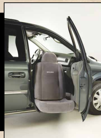
TURNING AUTOMOTIVE SEATING™ (TAS™)

Founded over 20 years ago, Bruno Independent Living Aids, Inc., is a world-wide manufacturer of accessibility products designed to enhance the lives of those challenged by limited mobility. In pursuing this goal, Bruno is proud to be the only U.S. manufacturer of indoor/outdoor stairlifts, interior/exterior scooter, powerchair and wheelchair vehicle lifts and Turning Automotive Seating™ (TAS™) products to be ISO 9001 Certified. This is one of the most stringent, widely-recognized quality standards in the world and your assurance that Bruno is committed to providing you with the highest-quality, most reliable products in the industry. Ask your certified Bruno dealer for details on all Bruno independence products.