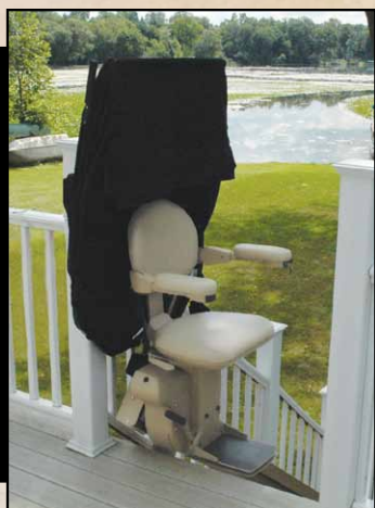
OUTDOOR ELECTRA-RIDE™ ELITE Model SRE-2010E

Home accessibility solutions and automotive products